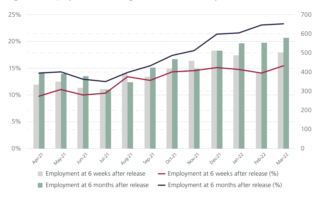
Figure 2. Employment following release from custody

Ministry of Justice data shows that 16 per cent of prison leavers released between April 2021 and March 2022 were in employment six weeks after they left custody, while just 23 per cent had a job six months after they left the prison gate. The Government has pointed to these figures (which have increased by 57 per cent and 66 per cent respectively) as evidence of the effectiveness of their interventions to boost prisoner employability.